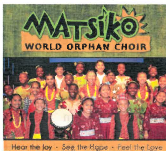
Hear the Joy • See the Hope • Feel the Love

Come listen to an incredible children's choir made up of orphaned children from around the world. They will be selling handcrafted items from their home countries and taking a love offering during the concert to support their work. This is open to all in the community— Please spread the word!!!!