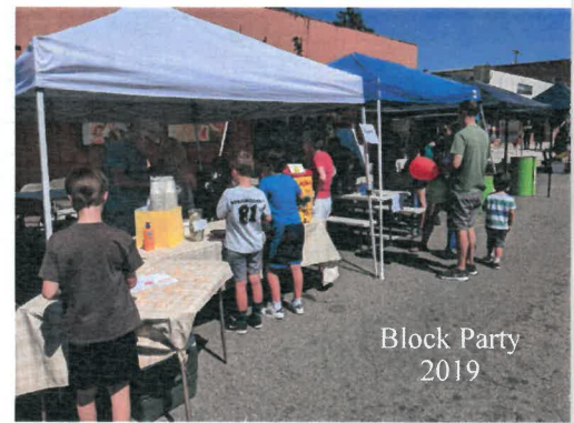
Block Party 2019